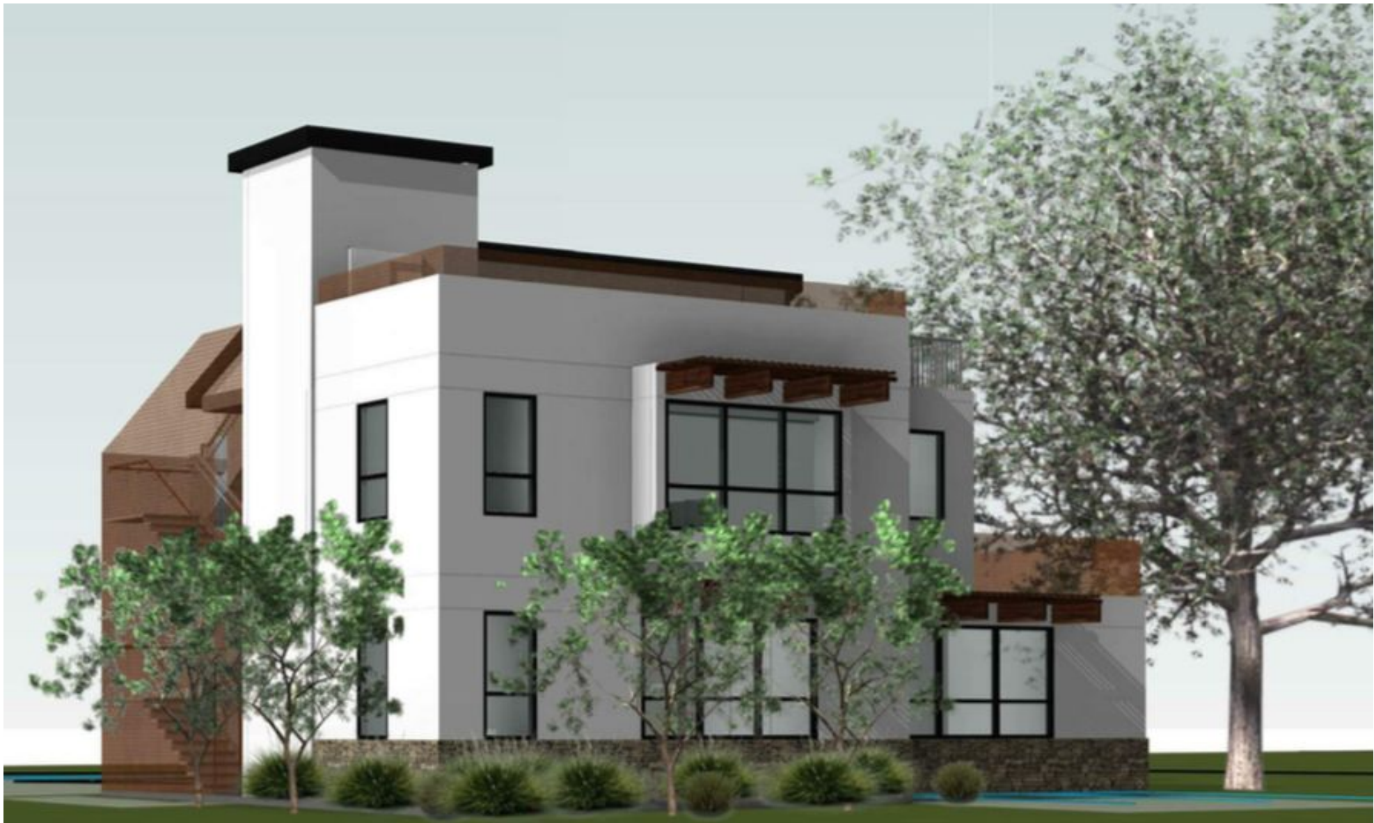
The New 314