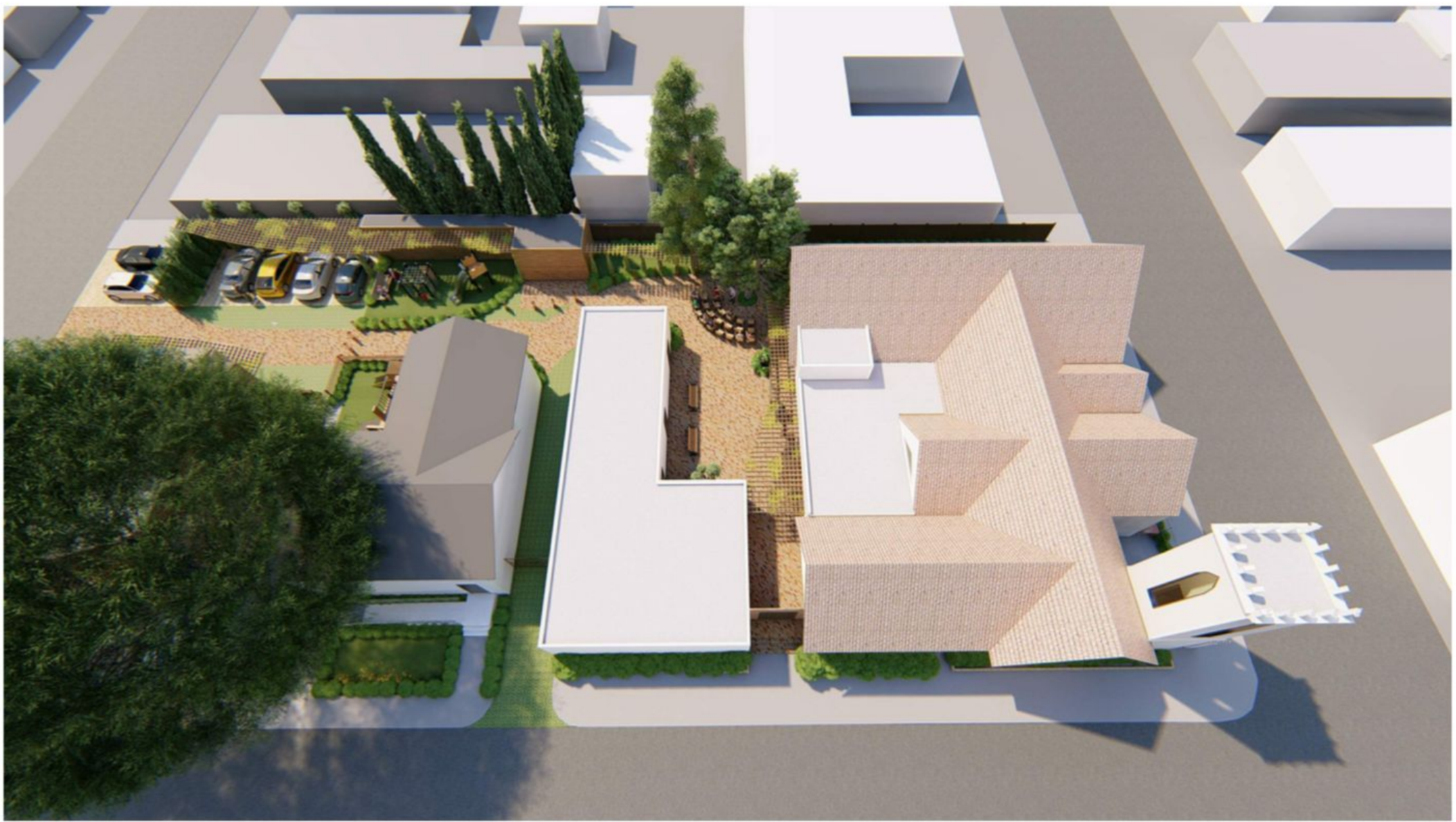
The Main Campus